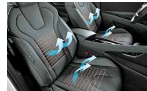
Heated & Ventilated Seats (1st Row)