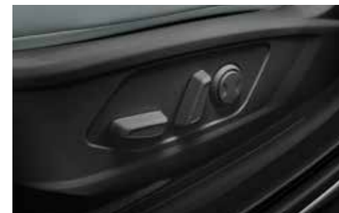
Power Driver's Seat (8-way, lumbar support)