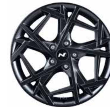
18" Alloy Wheel(N Line)