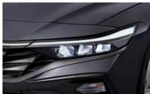
Full LED Headlamps (MFR type)