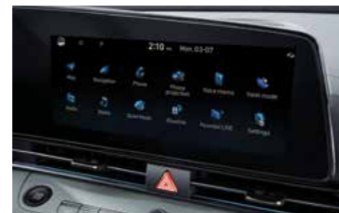
10.25-inch Navigation Display