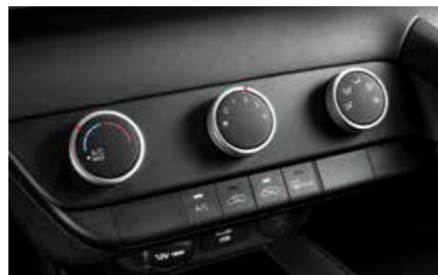
Manual Air Conditioner