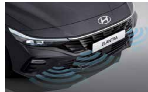
Parking Distance Warning (Forward/Reverse)