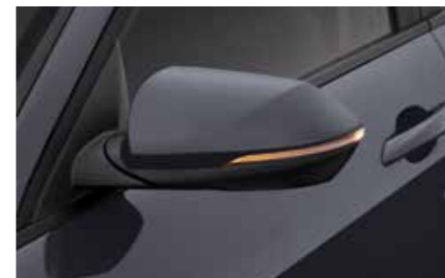
Exterior Sideview Mirrors (heated, power folding, LED turn signal indicators)