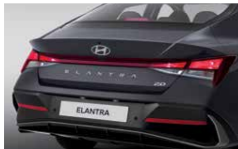
Bulb Rear Combination Lamp