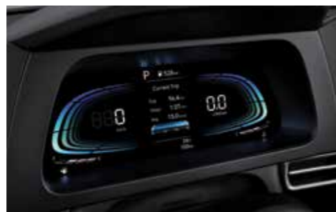
Cluster (4.2-inch color LCD)