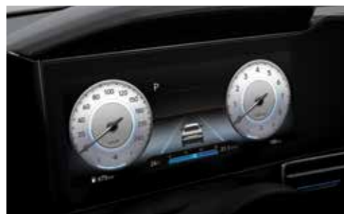
Cluster (10.25-inch color LCD)