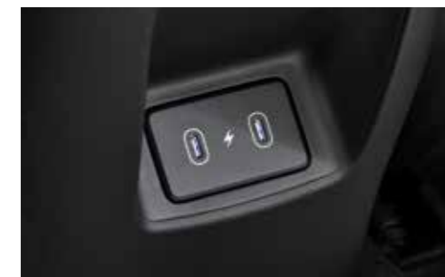
USB-C type Charger (2nd Row)