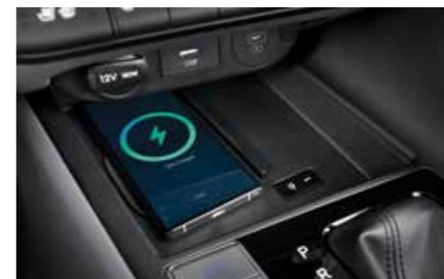
Wireless Smartphone Charger