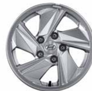
15" Alloy Wheel