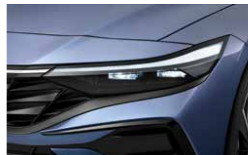
Thin-type Full LED Headlamps