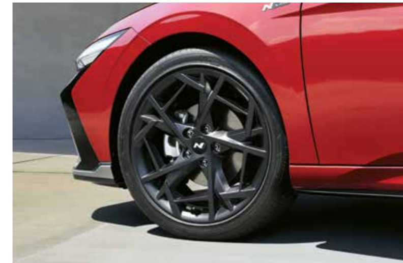
N Line Exclusive 18-inch Alloy Wheels and Tires