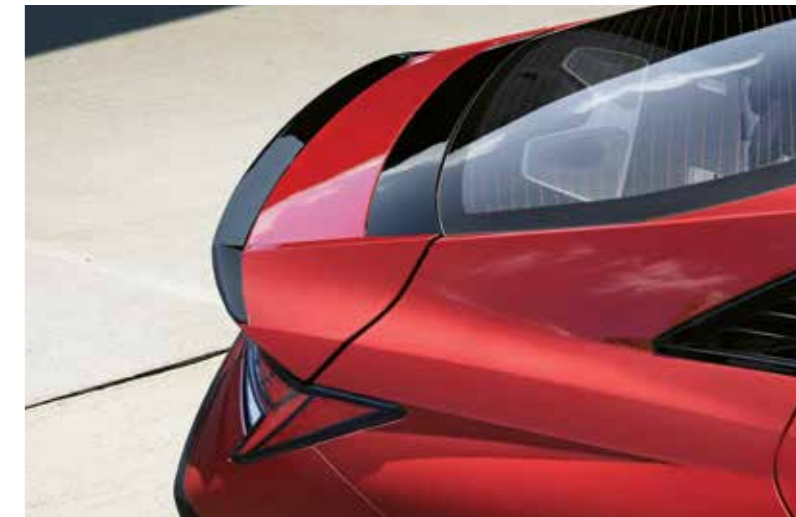
N Line Exclusive Lip-type Rear Spoiler