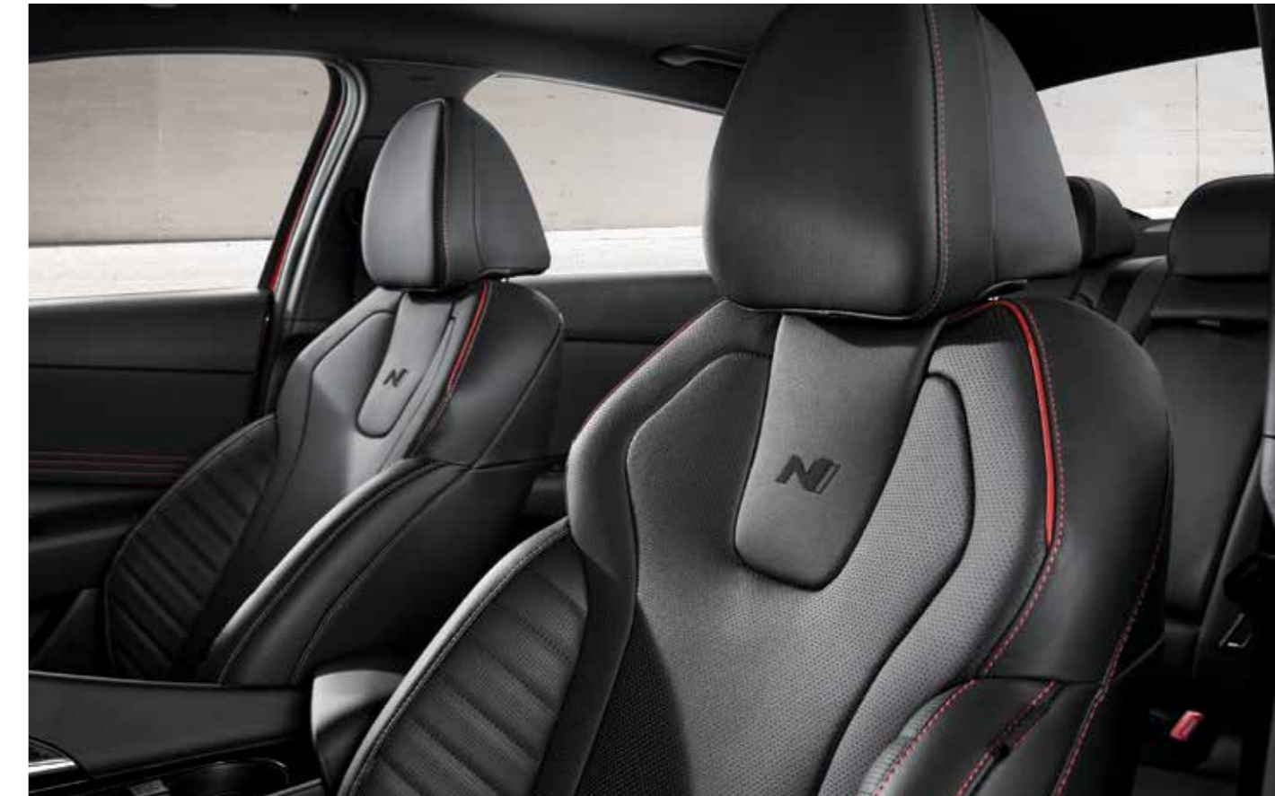
N Line Exclusive Authentic Leather Seats