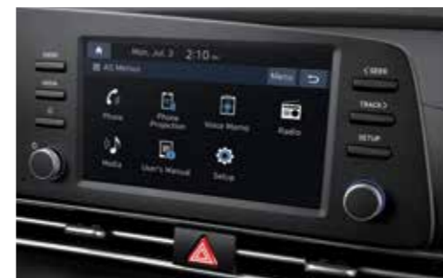
8" Display Audio System (matt, when selecting 4.2" color LCD cluster display)