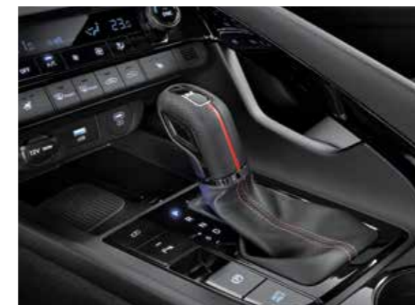
N Line Exclusive Sports Steering Wheel with Extended Paddle Shifters N Line Exclusive Leather Gear Knob