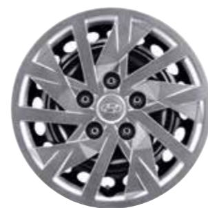
15" Steel Wheel & Wheel Cover