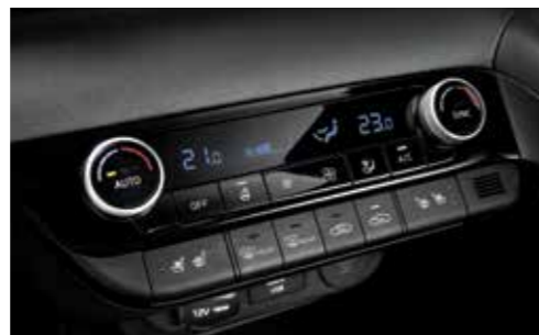
Dual Full Auto Air Conditioner